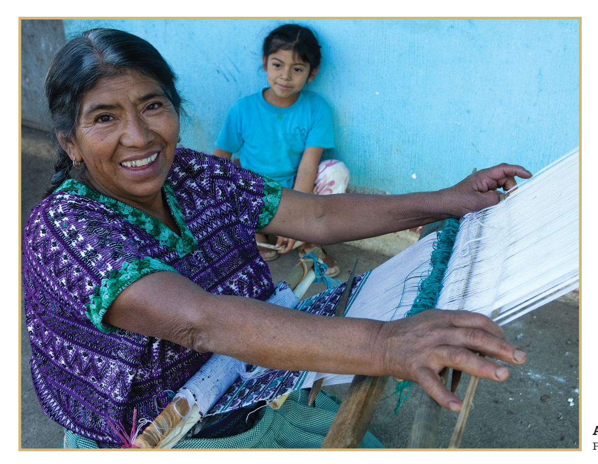
A Guatemalan weaver.

This fund aims to reach those working poor persons emerging from extreme poverty not yet with a stable source of income to regularly meet basic needs. Unfortunately, the partner organizations that are well placed to help these people often lack sufficient financial resources, credit history and capacity to deliver more to these communities in need. WCCN will provide loans coupled with technical assistance to help build the partner's capacity and track record for credit over time.